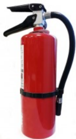
Use one and go!