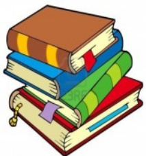
Books are one of the more expensive accessories for education.

The awards will be given in the latter part of March 2018.