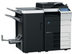
Tenant Focus Printer

Here is some history about the Tenant Focus, some news on current improvements and what changes we are making this year.