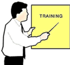
Chism brings training to each community

SHRA has been updating its resident safety handbook to keep the contents current and useful. The manuals are customized for each community. Thus you have the proper phone numbers in case of an emergency.