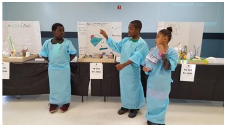
(Pictured) TEAM TWO: The Little Red Rovers

14 Youths from the Adler Grove Community and Marina Vista Community participated in the Mars Habitation Celebration 2018, which is one category of competition for the University of Houston's annual Mars Rover Celebration competitions. 10 students formed 3 teams and completed the program. The teams were challenged to build a 2ft by 2ft models using recycled and household materials. Each team had to find a mission, how they would carry out that mission, and ultimately survive the harsh and unstable conditions on Mars (the Red Planet). The competition was held on 1/27/2018 with other students from Texas and other Housing Authority. The name of the teams that represented Alder Grove and Marina Vista are: Teen Goals, The Little Red Rover, and Black Yoshi.