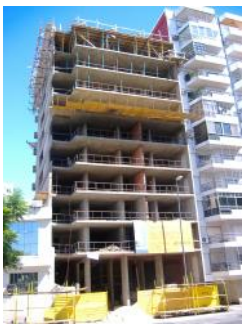
Capital funds can be used for major repairs to older buildings

The PHA Plan is a comprehensive guide to public housing agency (PHA) policies, programs, operations, and strategies for meeting local housing needs and goals. There are two parts to the PHA Plan: the 5-Year Plan, which each PHA reviews and updates once every 5th PHA fiscal year; and the Annual Plan, which is prepared by the PHA every year. PHAs submit to HUD a PHA Plan Template, which includes specific plan elements but also information on where certain plan elements that are not required to be reviewed by HUD can be obtained locally. PHAs use the same PHA Plan Template for the 5-Year and