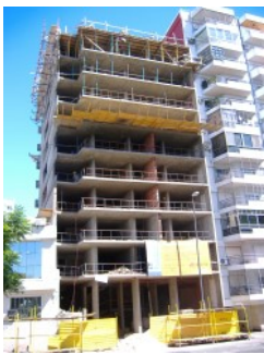
Capital funds can be used for major repairs to older buildings

The PHA Plan is a comprehensive guide to public housing agency (PHA) policies, programs, operations, and strategies for meeting local housing needs and goals. There are two parts to the PHA Plan: the 5-Year Plan, which each PHA reviews and updates once every 5th PHA fiscal year; and the Annual Plan, which is prepared by the PHA every year. PHAs submit to HUD a PHA Plan Template, which includes specific plan elements but also information on where certain plan elements that are not required to be reviewed by HUD can be obtained locally. PHAs use the same PHA Plan Template for the 5-Year and