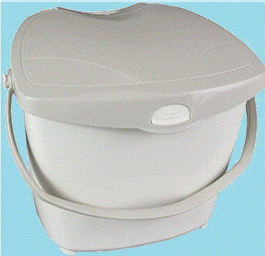
Sample food waste collection pail